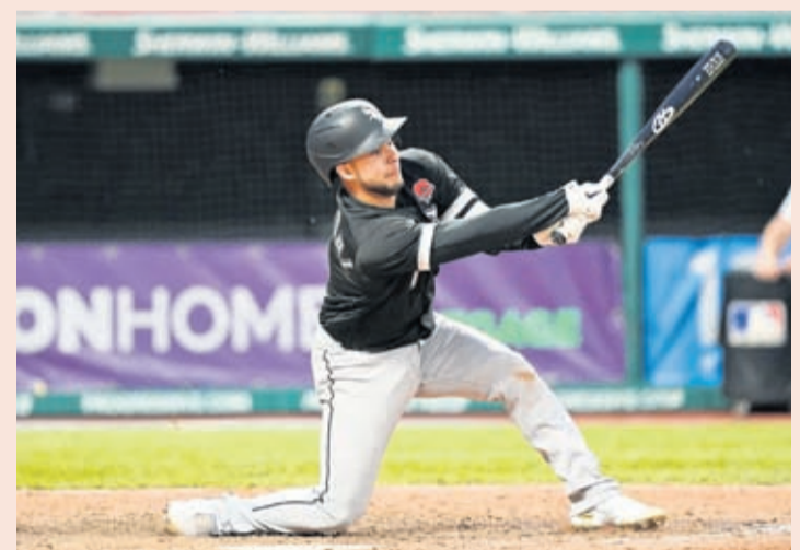
Chicago White Sox's Nick Madrigal strikes out swinging in the seventh inning of the second baseball game of a doubleheader against the Cleveland Indians, Monday, May 31, 2021, in Cleveland.

There have been six no-hitters, by San Diego's Joe Musgrove (April 9), Carlos Rodón of the Chicago White Sox (April 9), Baltimore's John Means (May 5), Cincinnati's Wade Miley (May 7), Detroit's Spencer Turnbull (May 18) and the New York Yankees' Corey Kluber (May 19). In addition, Arizona's Madison Bumgarner had a seven-inning hitless game in a doubleheader on April 25 that is not recognized as a no-hitter by Major League Baseball.